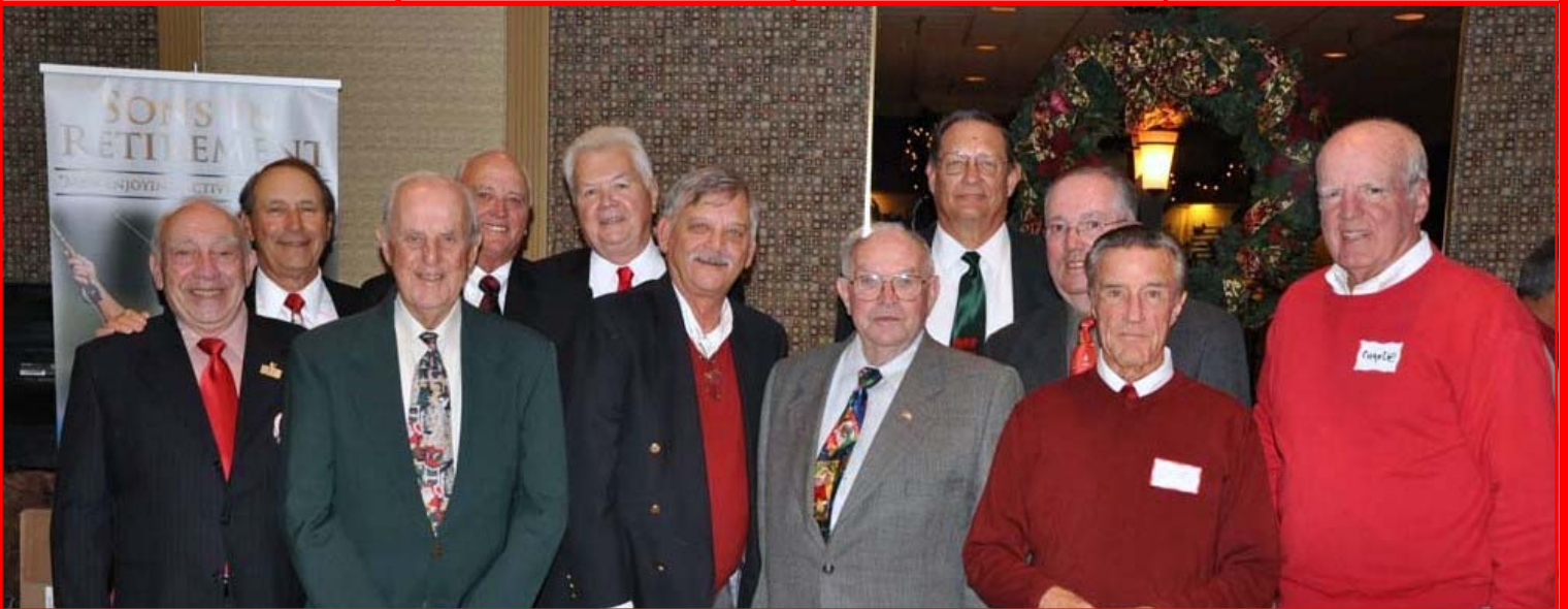
Congratulations to Our 2012 Officers and Directors!